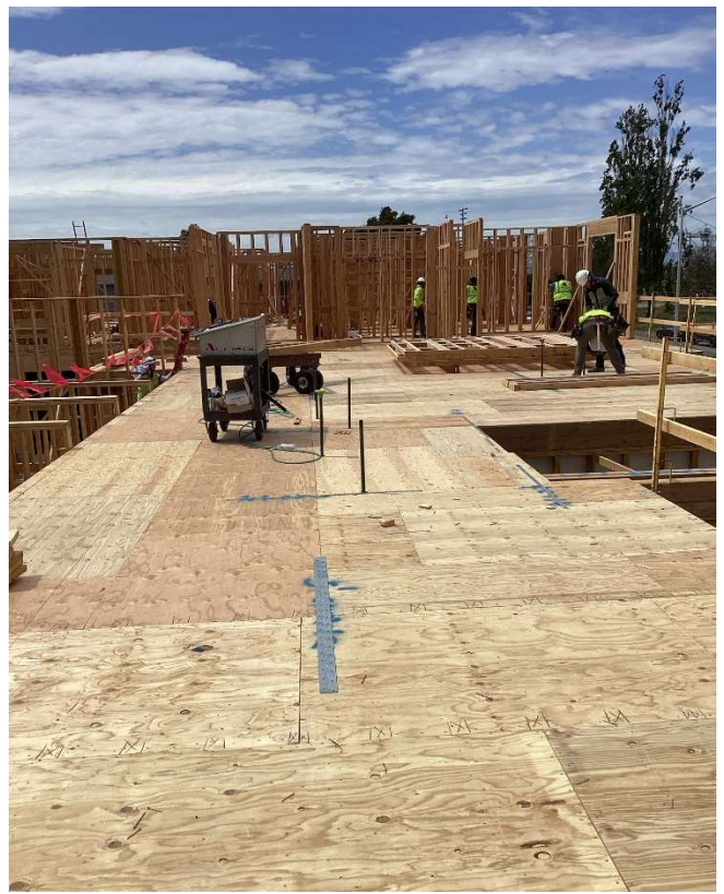
Second floor subfloor installation.

Aerial photo of the North Housing Block A site. The Estuary I is located on the top left corner.